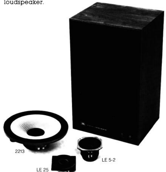
4311 Studio Monitor

As with all JBL loudspeaker systems, the component transducers, frequency dividing network and enclosure are designed and tested to function as a single, integrated unit. The enclosure is solidly constructed of 19-mm (3/4-in) stock throughout with wood-welded joints to prevent unwanted resonance. Internal padding absorbs spurious reflections and standing waves. All components mount directly to the baffle panel and are removable from the front of the enclosure. A ducted port provides proper acoustical loading of the low frequency loudspeaker.